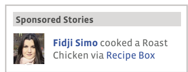
Make sure people see when their friends talk about your business